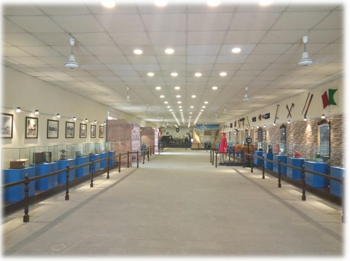
Old Gallery Golra Museum